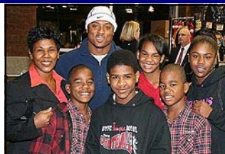
Family all smiles as they pose with Falcons' Warrick Dunn

The generosity of Dick's Sporting Goods allowed each youth to purchase items they would have never bought for themselves plus gave them