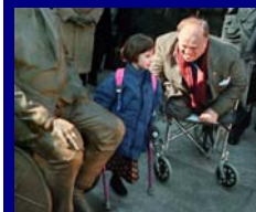
Former US Senator, Max Cleland

"You don't always achieve your goals but it is always important to have goals to achieve. Keep on believing... keep on dreaming."