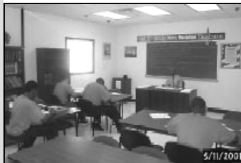
© GA Department of Juvenile Justice

Youth Detention Centers (YDC) provide temporary care and supervision of youths who are charged with juvenile delinquency and are awaiting disposition of their cases by a juvenile court, or who have been committed to the Department of Juvenile Justice (DJJ) custody by a juvenile court and are awaiting placement in DJJ treatment programs or facilities.